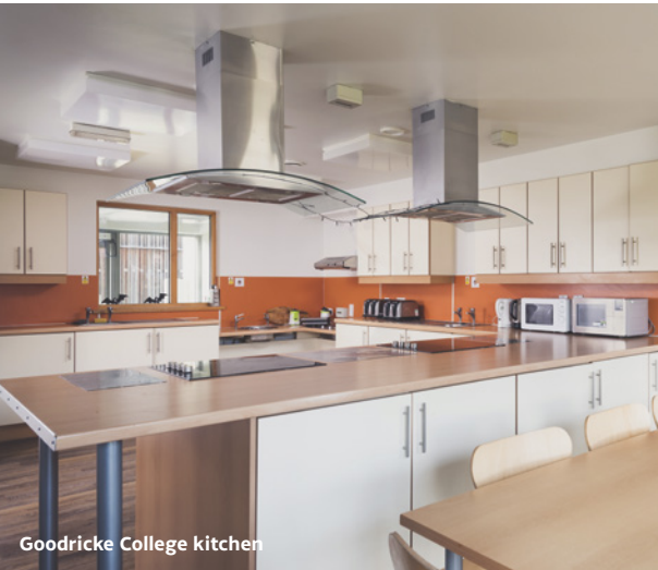
Goodricke College kitchen

The accommodation options shown here are subject to change and may vary.