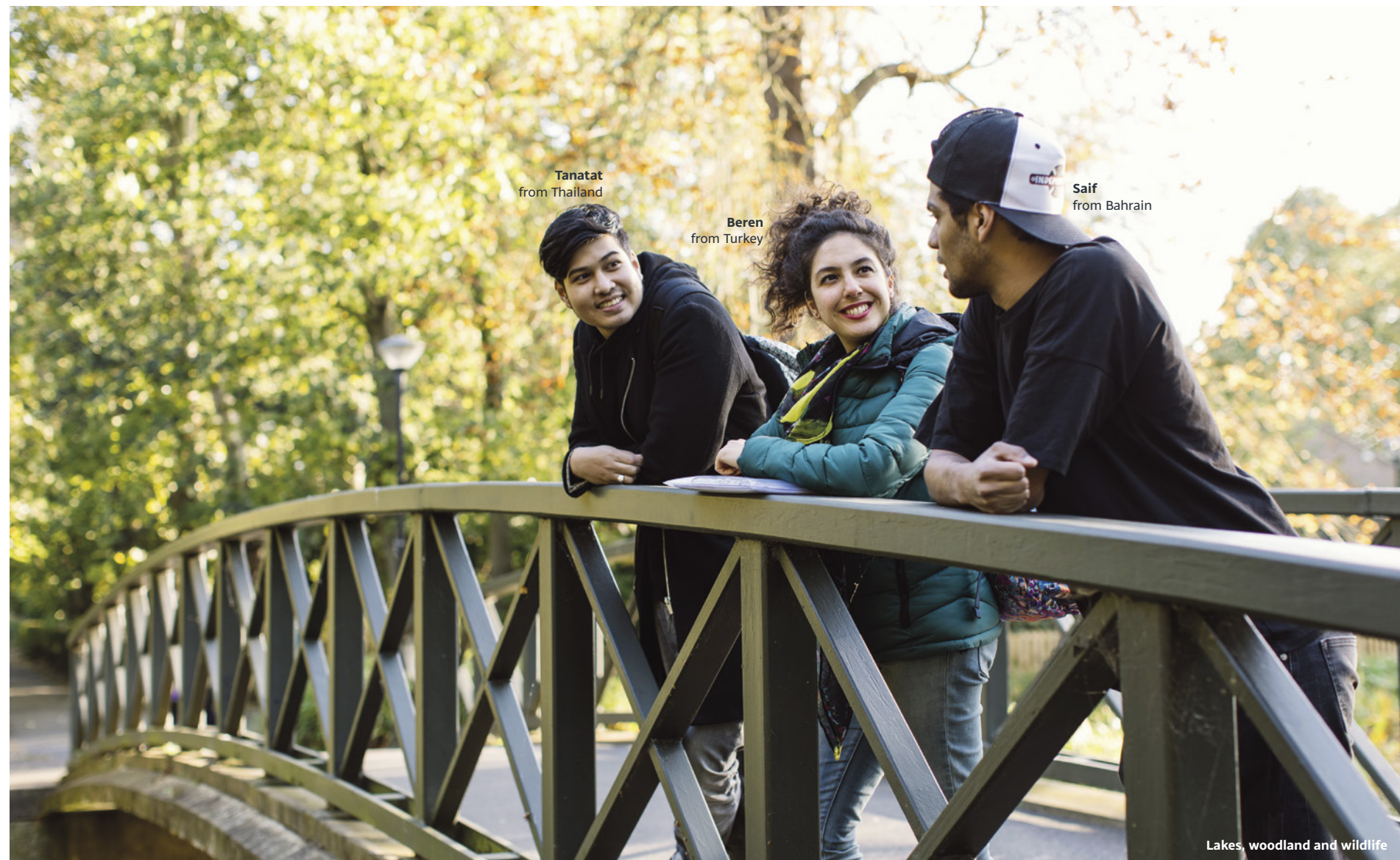
Lakes, woodland and wildlife

Outside the classroom, you can enjoy plenty of opportunities for fun, socialising and personal development. In fact, there are over 200 societies and more than 65 sports clubs to get involved with, covering interests as varied as hip hop, knitting, vegetarianism, comedy, video gaming, and meditation. There are also lots of international cultural societies from Thai to Russian – perfect for overseas students who want to meet people from their own country.