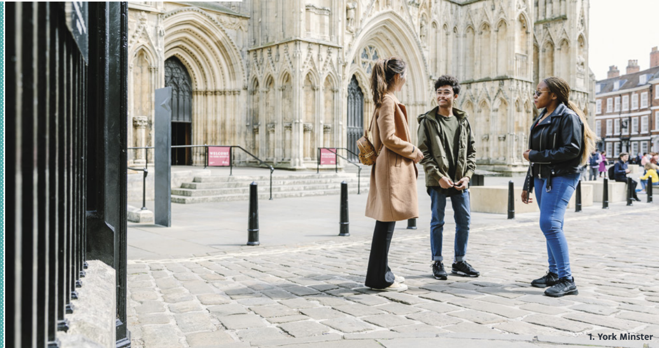
1. York Minster