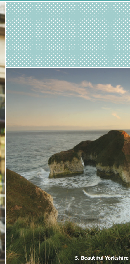
5. Beautiful Yorkshire