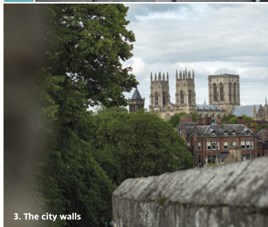
3. The city walls