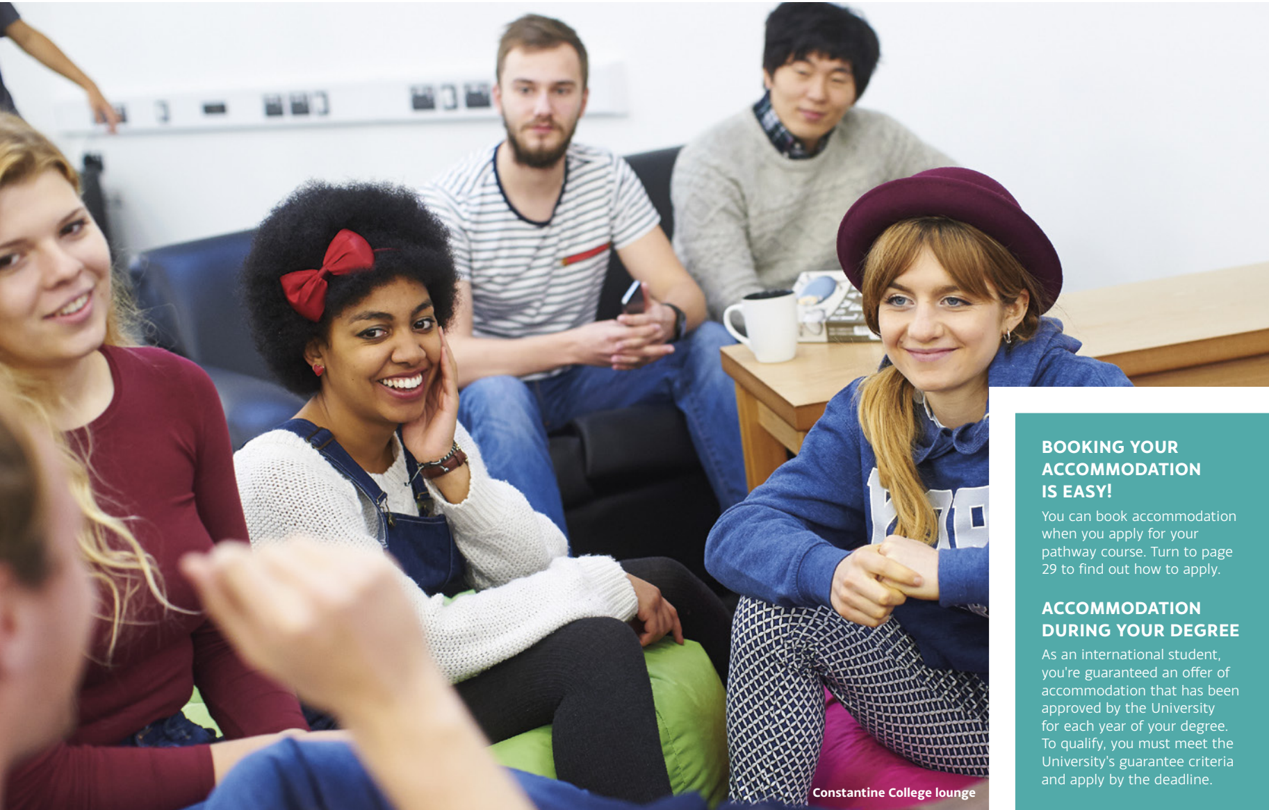
Constantine College lounge

You can book accommodation when you apply for your pathway course. Turn to page 29 to find out how to apply.