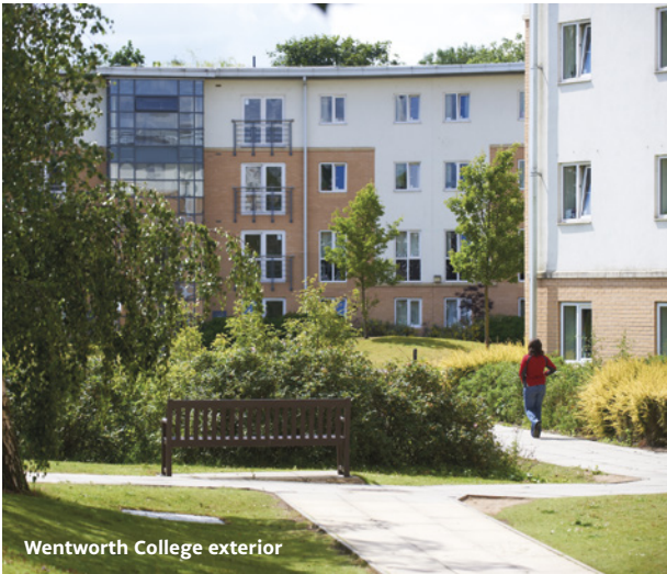
Wentworth College exterior