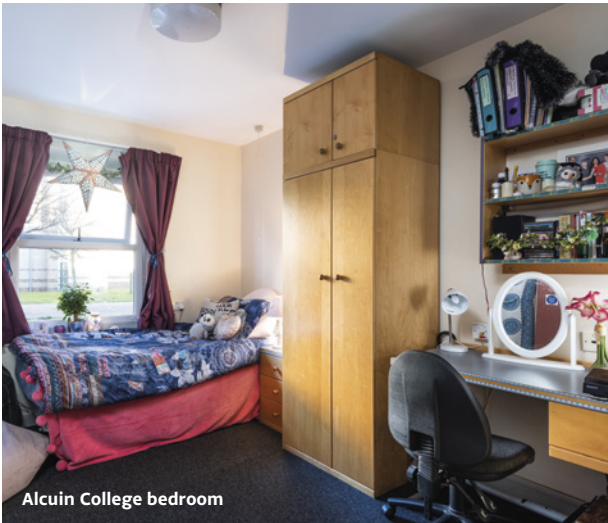
Alcuin College bedroom