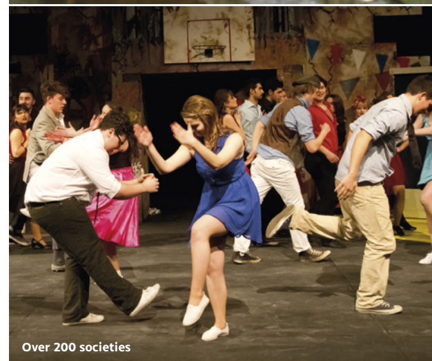
Over 200 societies