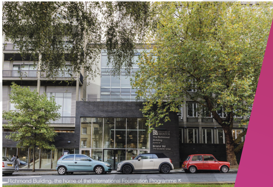
Richmond Building, the home of the International Foundation Programme

To date, students from over 50 countries around the world have studied the International Foundation Programme.