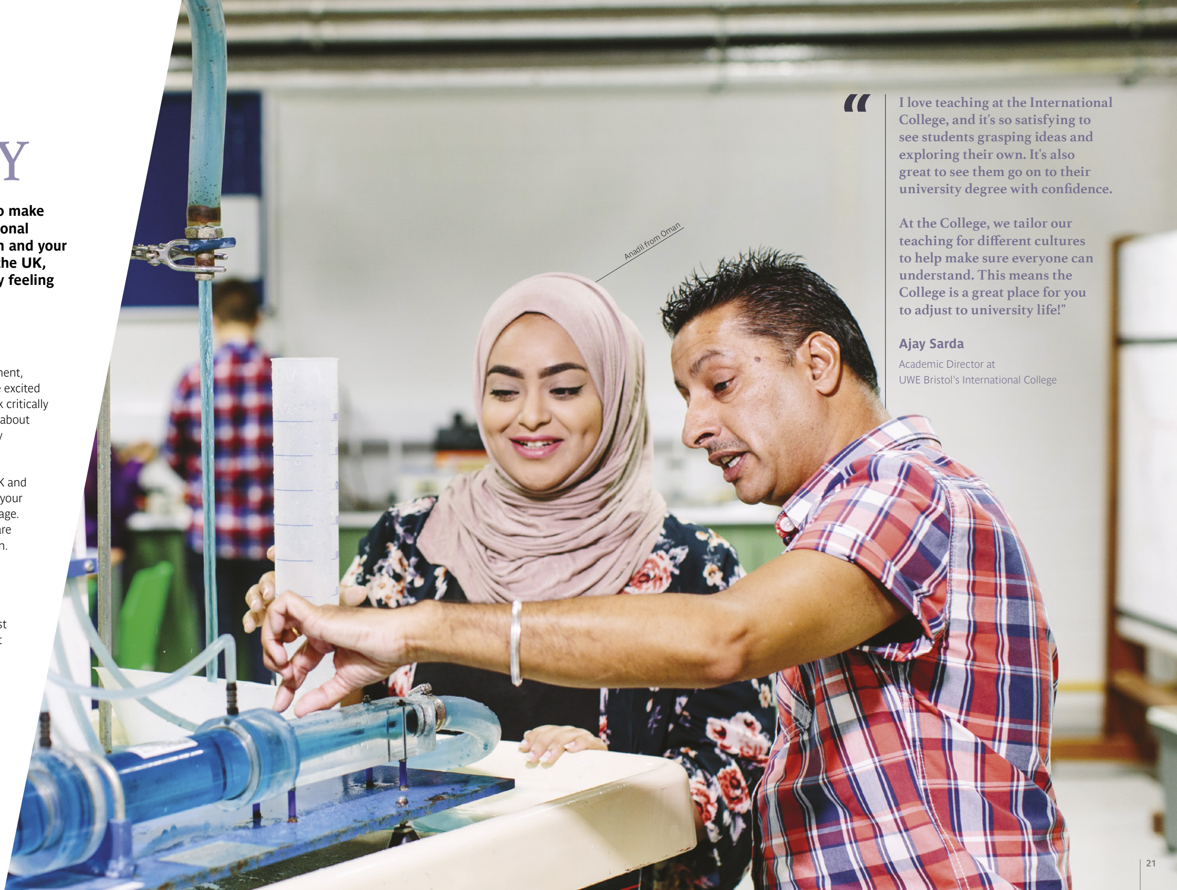
Anadil from Oman

Teaching support is tailored to each individual student, so you'll be able to learn at your own pace, and in your own way.