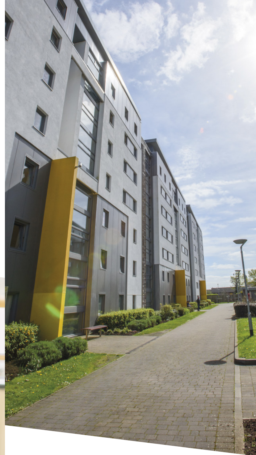
Precious from Nigeria